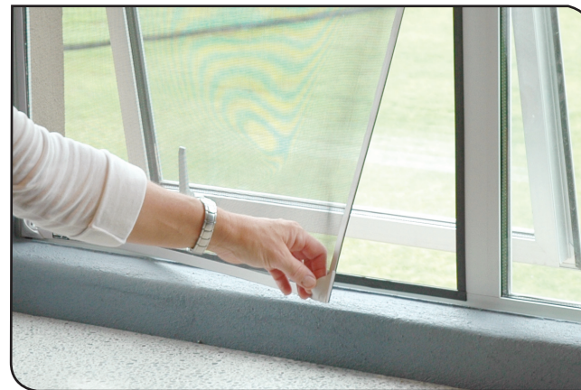
Complete seal by magnets.