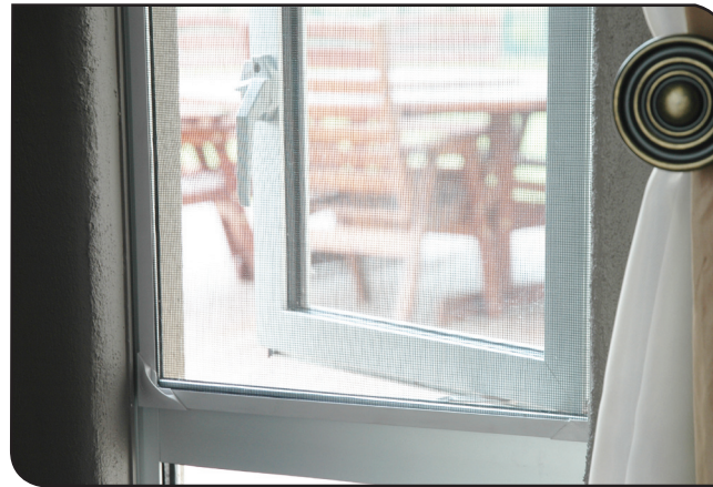
Unobtrusive when installed.